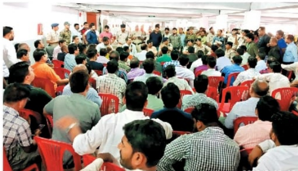
भोपाल। बैठक के दौरान उपस्थित अधिकारी व आमजन।