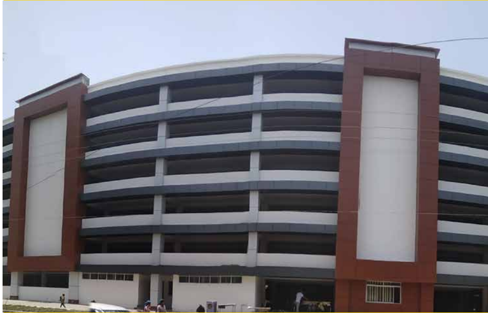
Smart Parking - T.T. Nagar