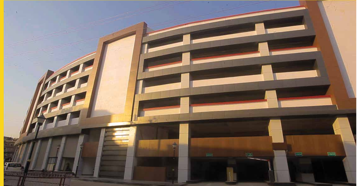
Smart Parking - M.P. Nagar

Also, facilities of paperless ticketing, integrated parking management, cashless ticketing, CCTV surveillance, smart parking cards etc. are in accordance with the India smart cities mission.